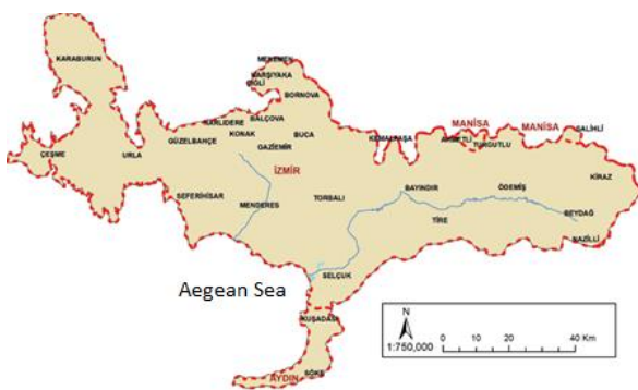
Figure 2. Küçük Menderes Basin (RMFWA, 2016)

Water samples were analysed for 10 variables (electrical conductivity-EC, total dissolved solids-TDS, chloride-Cl, nitrate nitrogen- \text{NO}_3\text{-N} , dissolved oxygen DO, biochemical oxygen demand-BOD, sulphate- \text{SO}_4 , sodium-Na, calcium-Ca and Magnesium-Mg) according to the standard procedures described in APHA (2005).