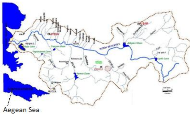
Figure 1. Büyük Menderes Basin (Senter International, 2004)

and its tributaries constitute the only surface water system in the study area, with an annual average discharge rate of 9.5 \text{ m}^3/\text{s} . The basin has hot and dry summers with mild and rainy winters. The mean annual precipitation calculated for the study area is 640 mm. Surface water quality class is not proper for many puposes in the region and main reason is uncontrolled industrial and agricultural discharges. (Yagbasan O, 2016; RMTEU, 2016 ). In the study data obtained on monthly basis along a year from 9 stations was subjected to evaluation to fingerprint water quality in the region