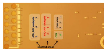
Figure 1: Photograph of the chip depicting the areas functionalized with the different mycotoxin-protein conjugates (sensors 1-9) and the non-reactive protein (sensor 10).

Chips accommodating 10 integrated BB-MZIs were chemically activated with APTES solution (Psarouli et al. , 2015). The chips were then spotted with mycotoxins-protein conjugates (100 µg/ml in 0.05 M carbonate buffer, pH 9.2) using the BioOdyssey Calligrapher Mini Arrayer (Bio-Rad Laboratories, Inc.) following the spotting scheme, depicted in Figure 1. After spotting, the chips were incubated overnight at RT under controlled humidity conditions (75%). Then they were rinsed with washing buffer, blocked for 1 h through immersion in a 1% (w/v) BSA in 0.1 M NaHCO 3 , pH 8.5, and then again rinsed with washing buffer (0.01 M Tris-HCl, pH 8.25, containing 0.9% NaCl) and distilled water and dried under a N 2 stream. Dried biochips were used either immediately or kept at 4 °C in a desiccator until use.