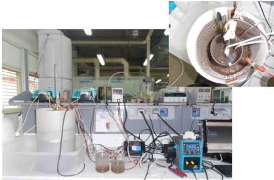
Figure 1. Picture of the eMBR used for the experimental activity

A laboratory scale electro MBR, developed from the authors in a previous study (Borea et al. , 2017), was used for the experimental activity (Figure 1).