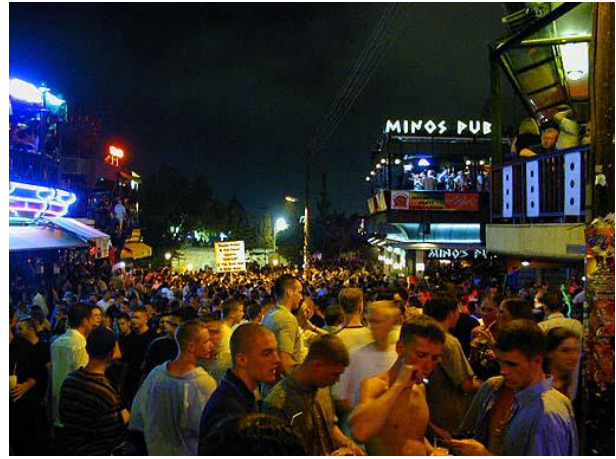
Photo 1. The centre of Agia Napa closed to Medieval Monastery during 1970 and at the end of 1985.

Indicators can be derived using qualitative and/or quantitative approaches, and the application of indicators can help elucidate complex realities (Holden, 2006). As an indicator, sustainability has become a keystone for tourism, environmental management, and environmental studies (Lee and Hsieh, 2016). Indeed, sustainable tourism indicators are broadly recognized as useful tools for planning rural or cultural tourism (Blancas et al. , 2011; Lozano-Oyola et al. , 2012), managing crises (de Sausmarez, 2007), managing community tourism (Choi and Sirakaya, 2006), assessing tourism destinations (Pérez et al. , 2013), measuring responsible behaviour and tourism practices (Blackstock et al. , 2008), and selecting criteria for policy implementation and scientific recognition (Tanguay et al. , 2013).