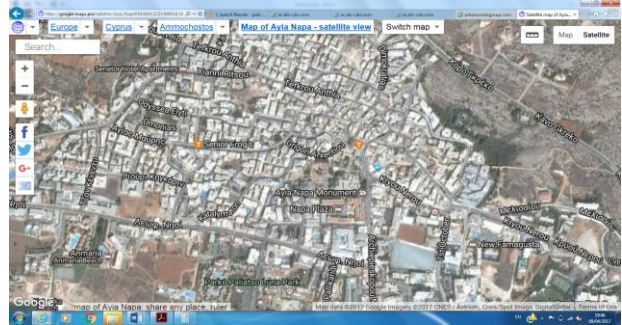
Map 1. Centre of Agia Napa Municipality

Step 1, determine the area to be audited: The area include a square of almost 500 x 1000 meter and consist the core of the Municipality (Map 1), where the tourist industry was developed after 1970 until the late of 90's as now the tourist enterprises and hotels were mostly moved closed or nearest to the sea.