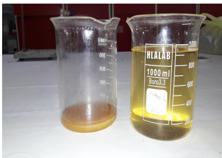
Figure 2. Biodiesel and glycerin