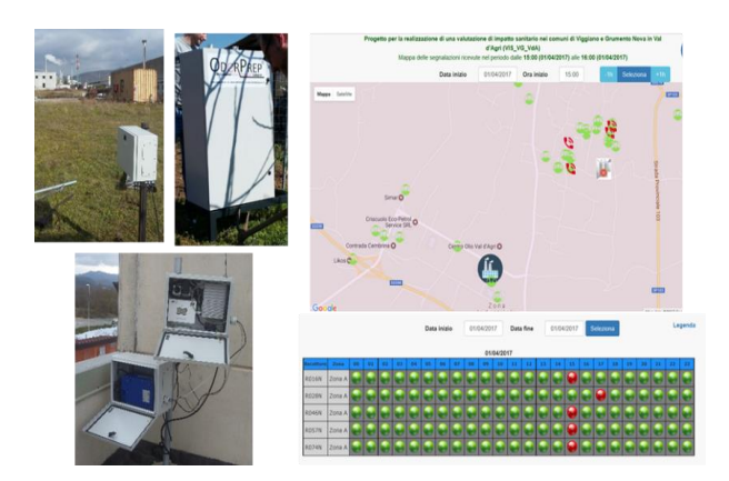
Figure 3: PID, electronic nose, OdorPrep and an example of OdorLab network

Figure 2. PID Network (8 coulored square) and COVA (Red rectangle).