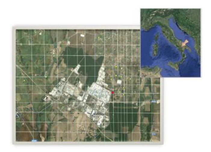
Figure 1. The 'Centro Olio Val D'Agri'and its position in South of Italy.