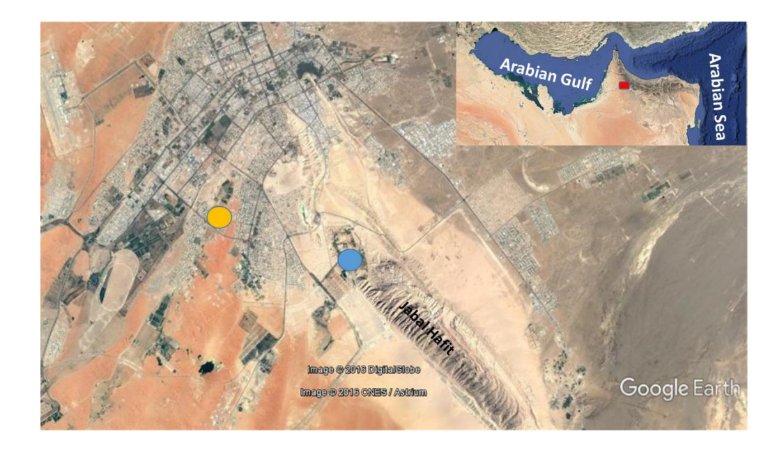
Fig. 1 Location map of Al Ain showing the area of clastics aquifer wells (yellow ring) and the area of carbonates aquifer wells (blue ring).