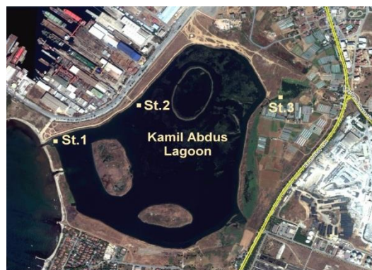
Figure 1. Map of Kamil Abduş Lagoon and sampling sites.

They are unique and constitute very sensitive natural habitats for many life forms. In addition, they have great socio-economic importance in terms of providing opportunities for agriculture, aquaculture, fishing, tourism and recreation. Because of nutrient richness, lagoons are one of the most productive coastal ecosystems, hosting a wide variety of species. Increasing pollution levels resulting from growing population and industrialisation pose a significant threat to water quality and aquatic life in lagoons (Kocatas, 2008; Kislalioglu and Berkes, 2001). Turkey is a coastal country surrounded by the sea on three sides and has a shoreline spanning about 7,816 km. There are 72 lagoon areas in Turkey (Kocatas, 2008). Kamil Abduş Lagoon is one of the lagoons which is placed in the Marmara Region. It is also known as Tuzla Fish Lake or Tuzla Bird Lake due to its rich bird and fish fauna especially before the introduction of industrial works into this area. It was stated that in earlier studies after the drought, most of the birds migrated, leaving only a few species which gathered in the central part of the dried lake. The aim of our study is to determine the pollution level and create consideration for taking necessary precautions against the ecological problems in this lake ecosystem.