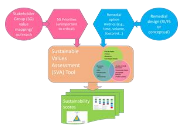
Figure 1. SVA Conceptual approach

A comprehensive analysis of the environmental, economic and social impacts associated with remedial alternatives provides a broader basis for decision-making rather than focusing on a narrow set of criteria. Moreover, integrating all of these factors into a common framework allows one to develop robust conclusions of potential trade-offs among the remediation alternatives.