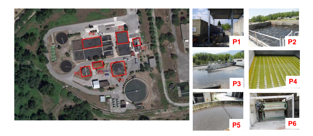
Figure 1. Investigated LWTP and odour emission sources