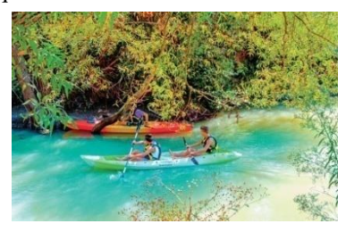
Fig. 9. Acheron river: rafting, http://www.ethnos.gr/

Alongside the development will protect both the antiquities and the riverbed.