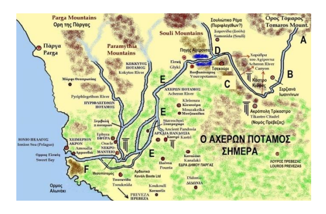
Fig.10.Acheron river, <a href="https://upload.wikimedia.org/">https://upload.wikimedia.org/</a> wikipedia/commons/2/2f/Acheron_today.JPG

Alternative tourism will also increase the revenue of the local community by reinforcing the possibility of economic survival in remote areas of the Greek territory.