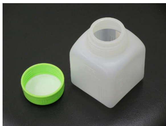
Figure 1. Polyethylene (PE) bottle